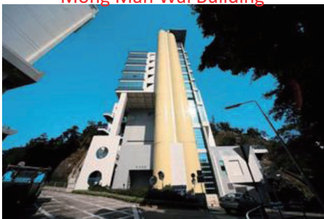
Mong Man Wai Building

CUHK coach second Stop, from University MTR station