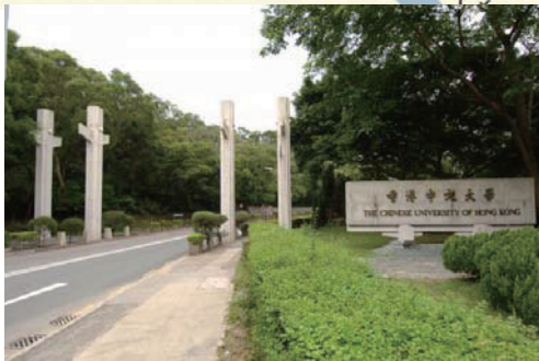
University main gate